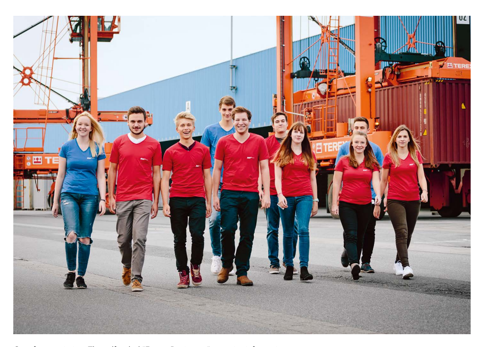
On a future mission: The self-styled "Future Designers" organize information events at schools focusing on opportunities at BLG LOGISTICS.