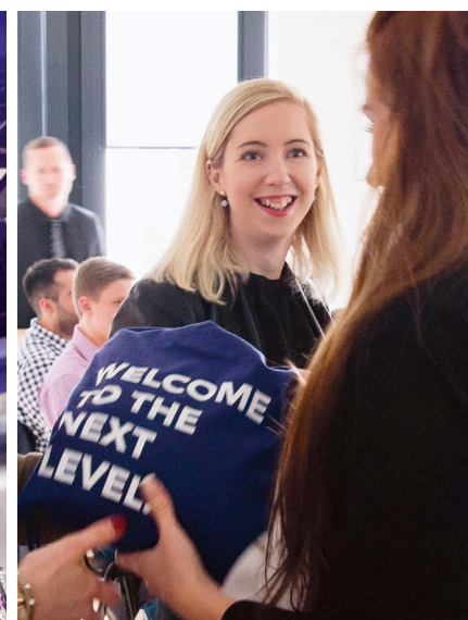
Individual experiences and fun in the group are just as important in our training program as the subject matter of the courses at the vocational school.

__ The port sector is traditionally characterized by internationality. Our company joins together more than 60 nations. In signing the Charter of Diversity, we have dedicated ourselves to equal opportunity. We welcome newcomers to Germany, support them on the road to employment and offer them prospects. The subject matter of the first year of training and the German language are taught in an entry-level training program. After successful completion the graduates can directly move on to the second year of training. In Bremen and Emmerich we invite employees without a traineeship to acquire the qualifications for warehousing logistics specialists. After all, pupils are more than their grades.