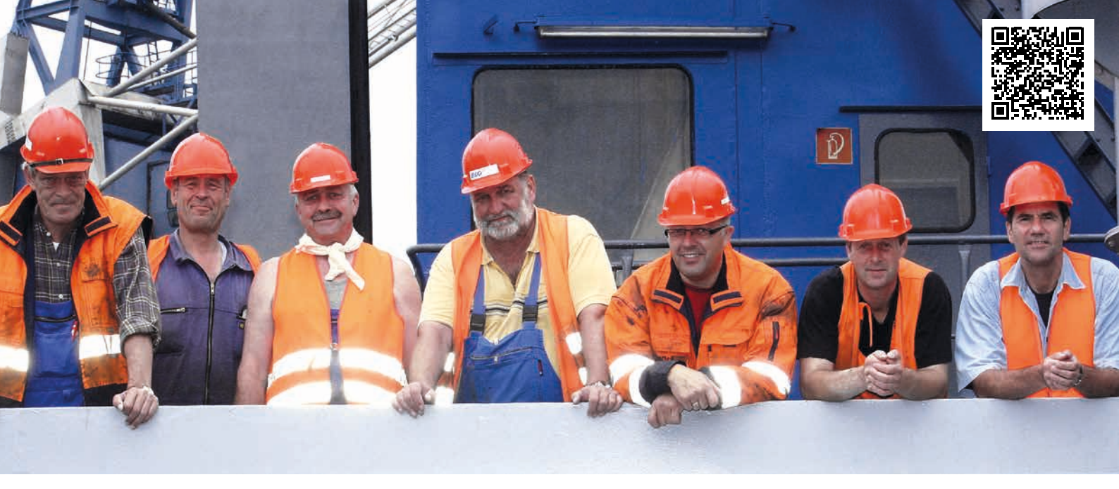
Colleagues from our heavy lift team